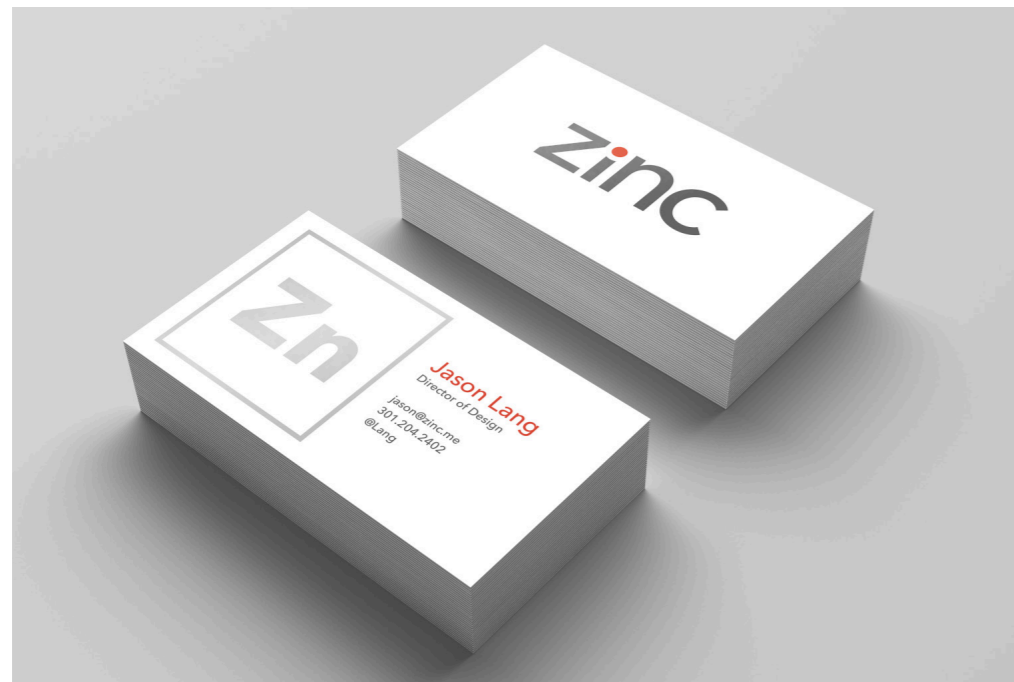
Official mark - Used as a basis for app icons